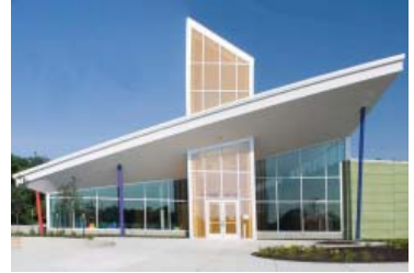
Kansas Children's Discovery Center

The City of Topeka has made a concerted effort to reinvent itself through redevelopment. This principle is at the core of the 2011 KACM Annual Conference theme. This mobile session will begin with an exploration of Monroe Elementary and the history of desegregation in Topeka culminating with the Brown v. Board of Education lawsuit. There will also be visits to Gage Park to discover the evolution of the park, which dates back to 1899. The afternoon tour will conclude with a visit to Gage Elementary, a school redeveloped into the thriving Topeka Civic Theater and home to the evening's entertainment, "A Christmas Carol—A Musical."