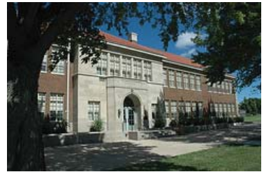
Brown v. Board of Education

Beverages at TCT Sponsored by: Trane Transportation Sponsored by: City of Topeka